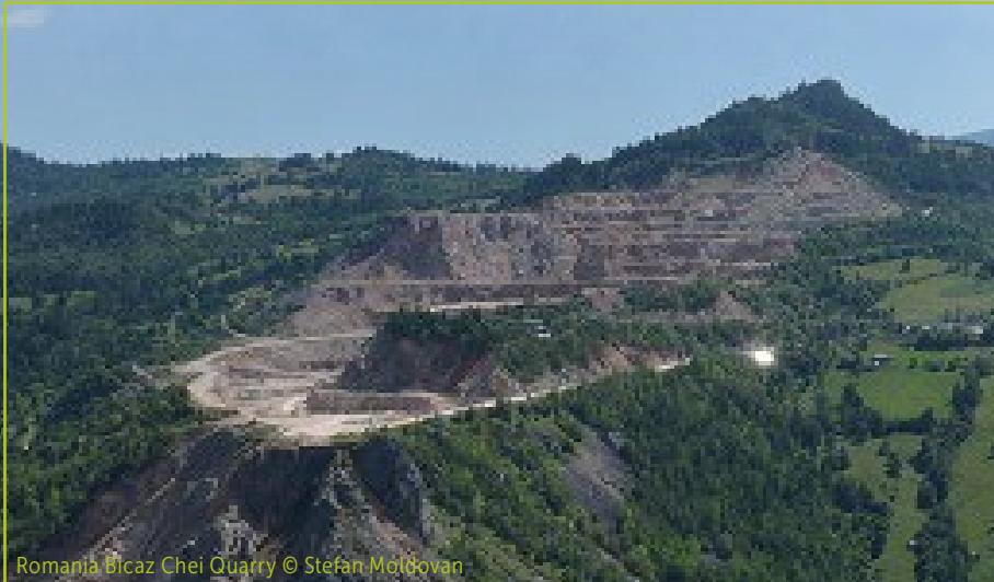
Romania Bicăz Chei Quarry

“ First of all you need to know your starting point, then plan what to do. Finally comes the ability to turn plans into actions and monitor progress.”